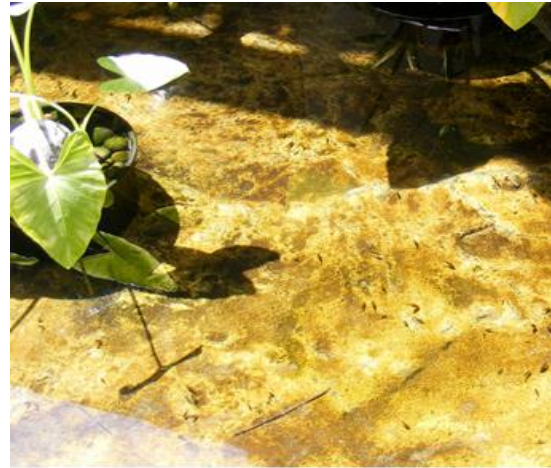
April 23 rd 2011