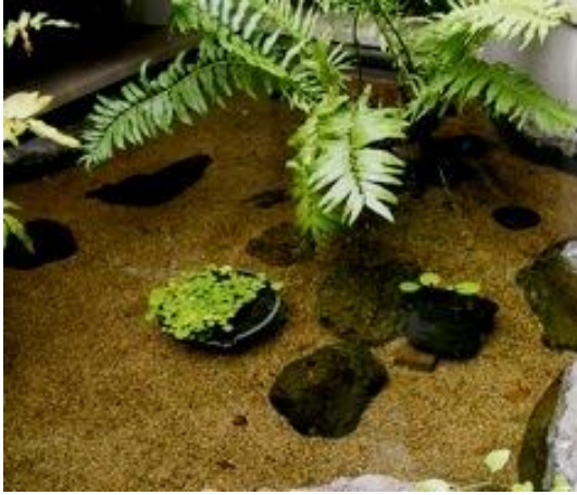
April 6 th 2011