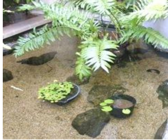
April 23 rd 2011