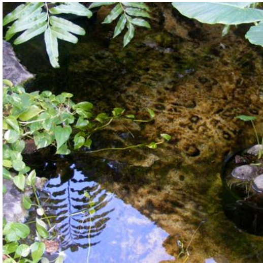
April 6 th 2011