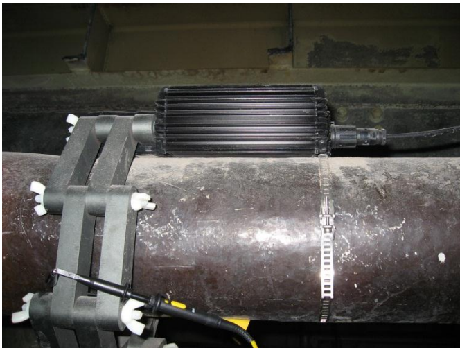
30' before the E1 shower nozzles