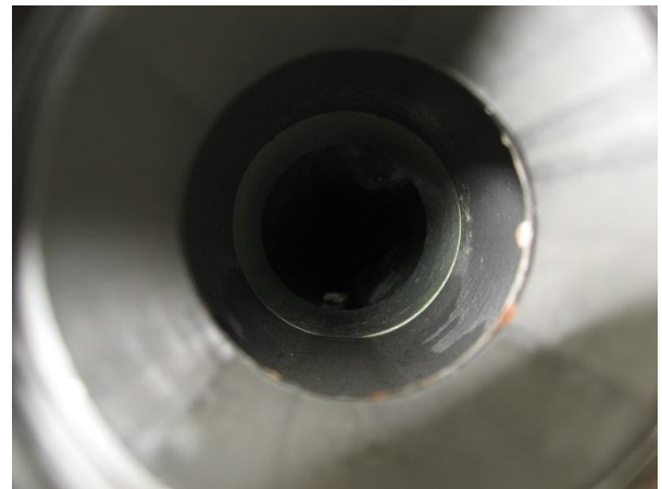
Treated E1 nozzle – 30' down the line

“Innovations that put nature to work for you!”