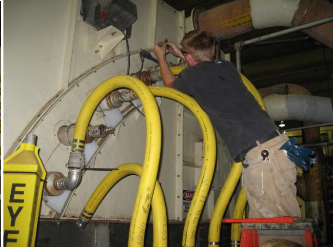
Treated E1 unit