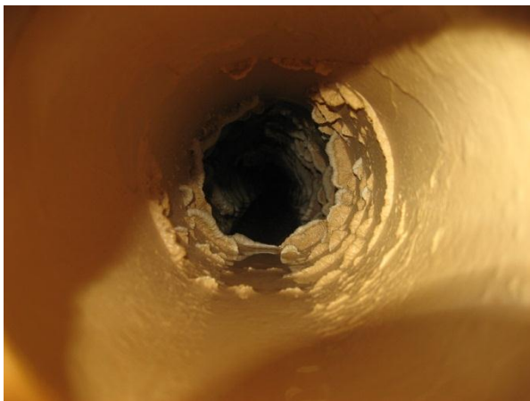
Untreated D1 nozzle – 30' down the line