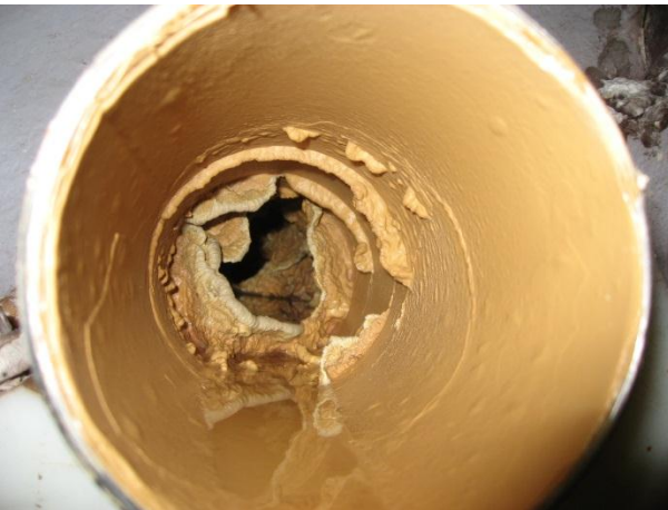
Untreated D1 nozzle – close up