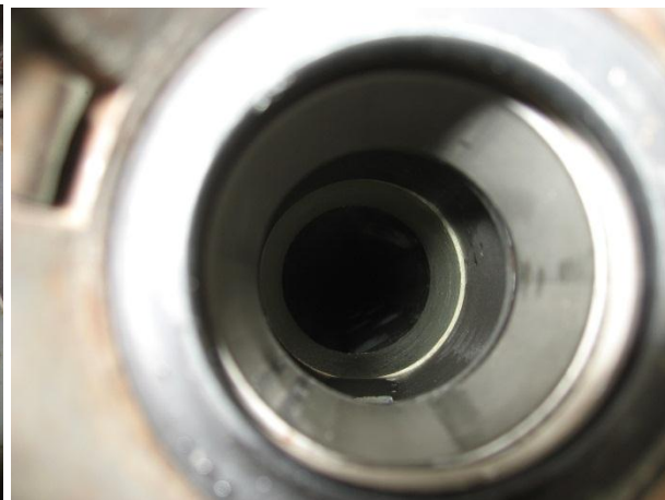
Treated E1 nozzle – close up