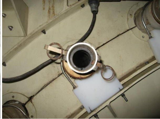
Treated E1 unit