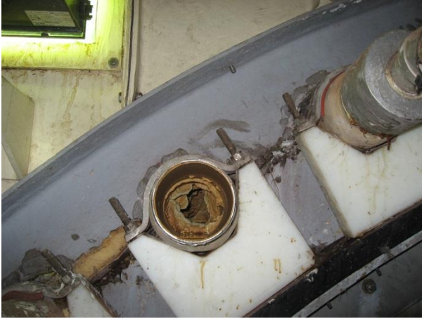
Untreated D1 unit