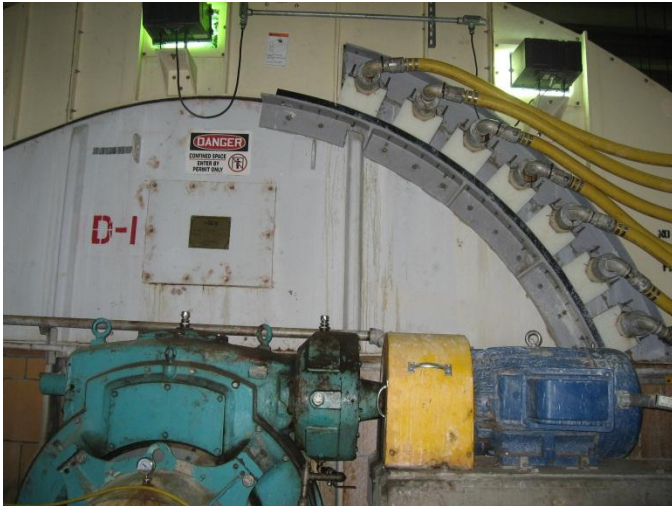
Untreated D1 unit