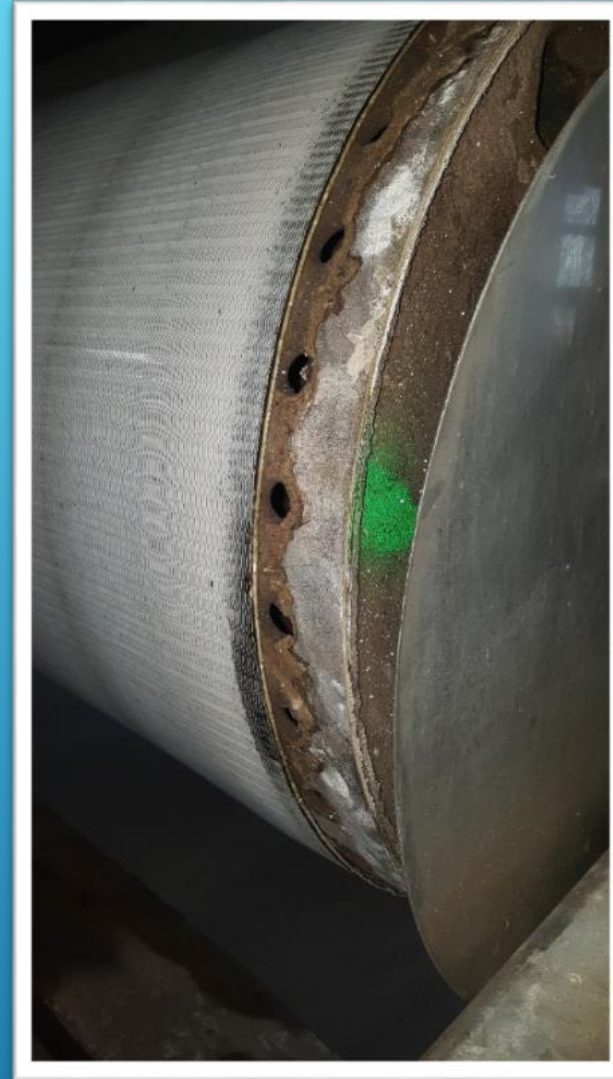
SIDE OF ROLLER JUNE 16, 2016