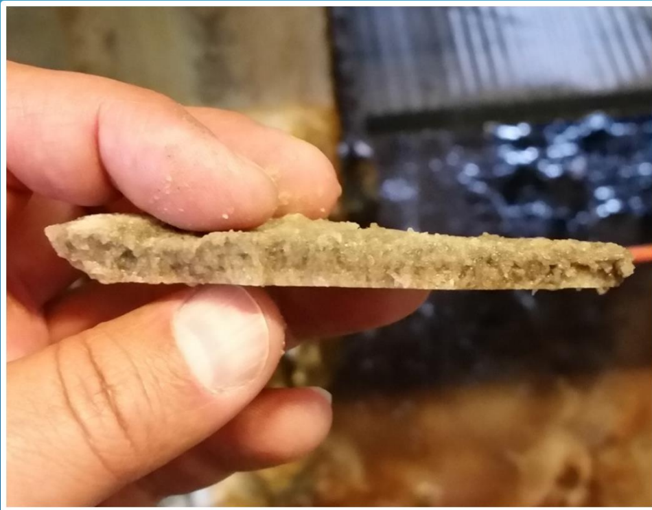
1/4 INCH STRUVITE BUILD-UP INSIDE THE BELT PRESS

A CHEMICAL-FREE METHOD OF REMOVING AND PREVENTING STRUVITE HAS BEEN DEVELOPED AND TESTED SUCCESSFULLY.