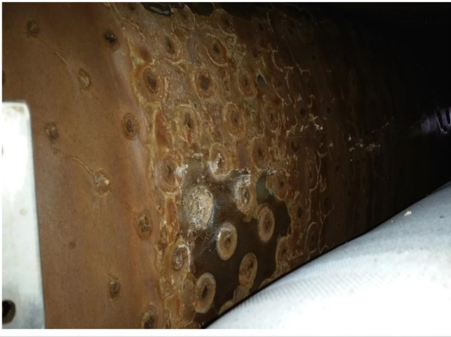
DRUM MAY 11, 2016