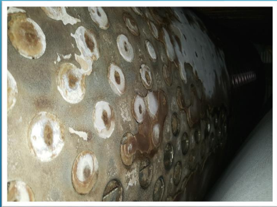
DRUM JUNE 16, 2016