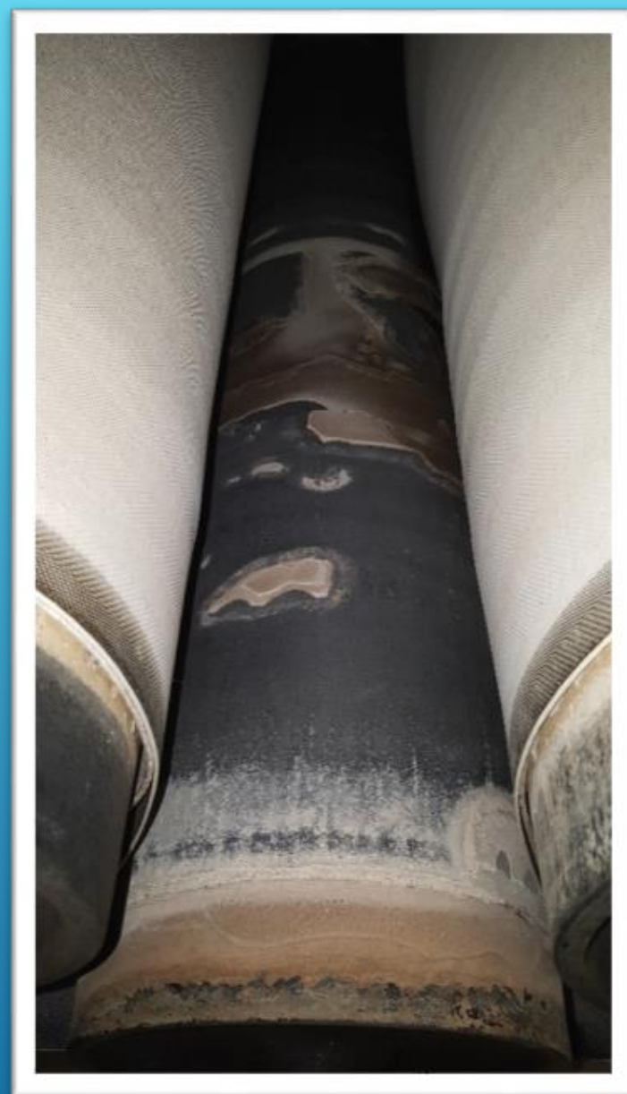
BOTTOM ROLLER JUNE 16, 2016