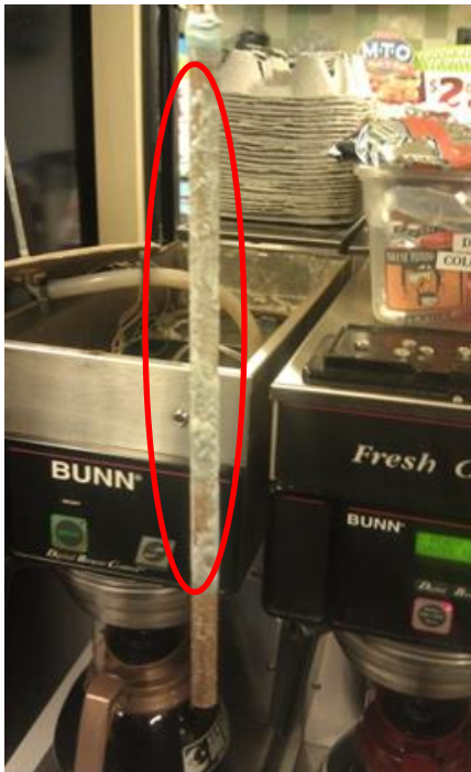
Before - 7 day accumulation (hard scale)

Before the installation of the HydroFLOW device, the store's equipment required weekly maintenance service to remove scale accumulation. Since the installation, minimal service was required.