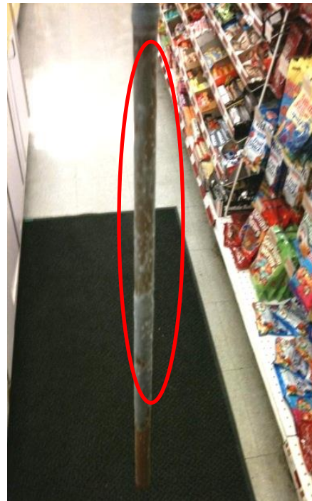
After - 90 day scale accumulation (soft and brittle scale)