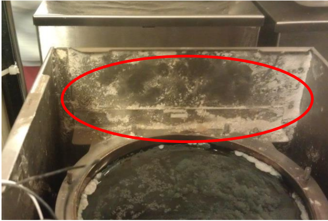
Before - 7 day accumulation