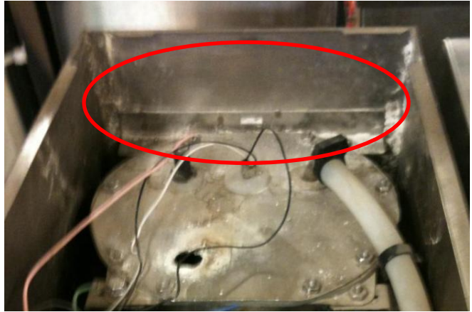
After - 90 day scale accumulation